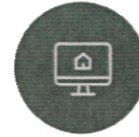
Manages Property Inventory

As the Corporation's administrator, the RPC will continue to explore and make recommendations to the Corporation for potential implementation/inclusion of new programs and activities that will maximize the Corporation's budget while furthering its mission and supporting other County and local community initiatives into Calendar Year 2021.