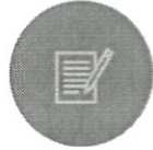
Programs & General Administration